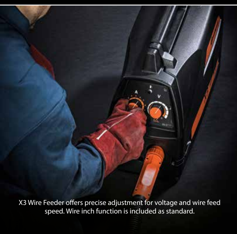
X3 Wire Feeder offers precise adjustment for voltage and wire feed speed. Wire inch function is included as standard.

When working in tough conditions at a construction site, shipyard or a metal fabrication workshop, or doing maintenance welding on a pipeline site in extreme temperatures, you need a companion that you can fully trust on.