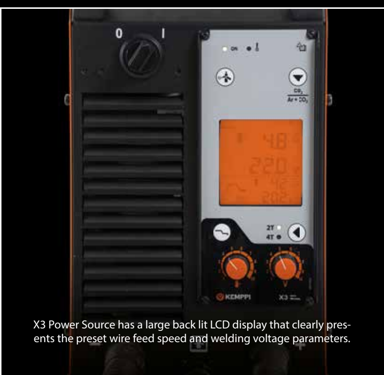
X3 Power Source has a large back lit LCD display that clearly presents the preset wire feed speed and welding voltage parameters.